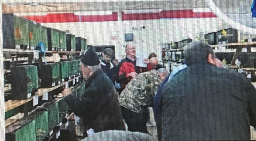
Sponsor Vista Workspace Solutions Ltd has supported the club for the past three years and added to the show's cash prize fund. The 2017 event had a prize fund of £900, with £150 being awarded to best in show

as perfect and we've received many positive remarks."