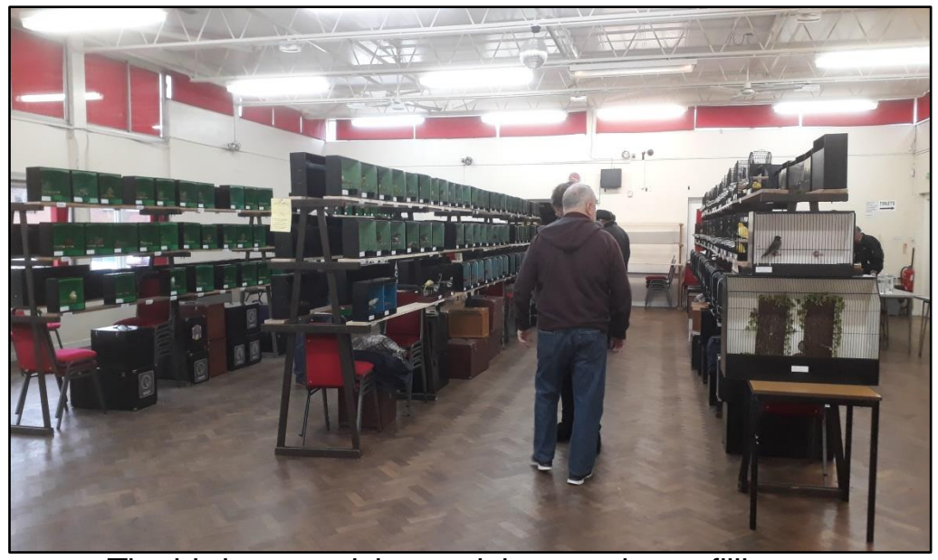
The birds are arriving and the stands are filling up