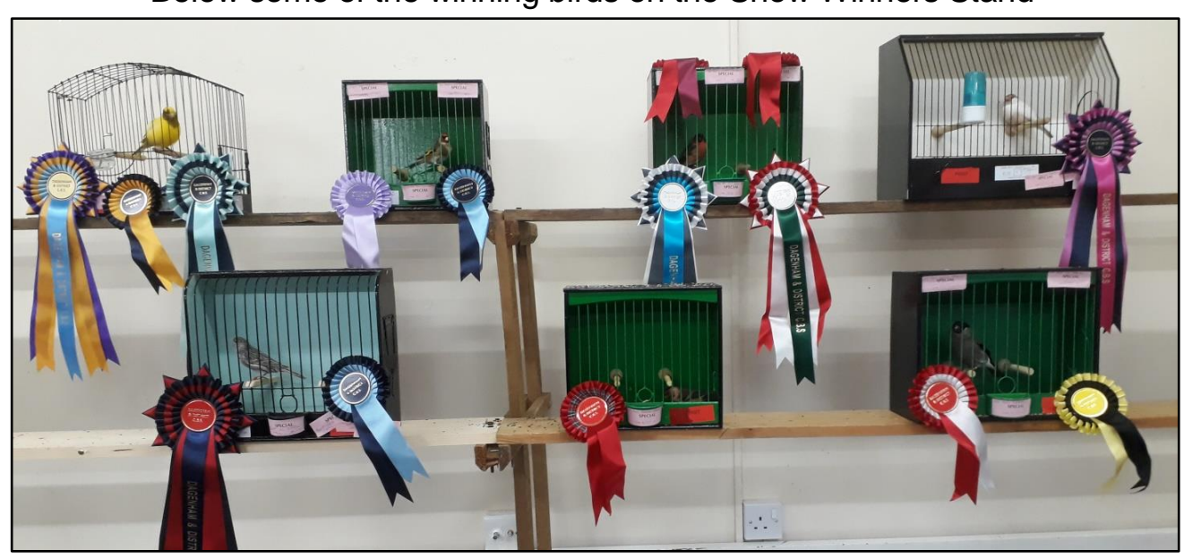
Below some of the winning birds on the Show Winners Stand