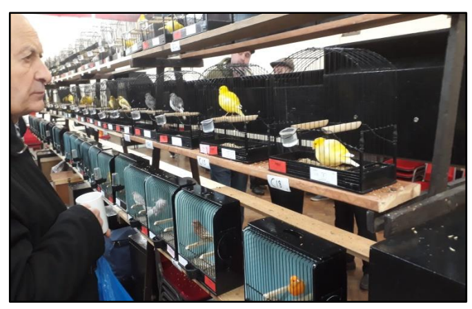
Ted having a look at the many birds at the show