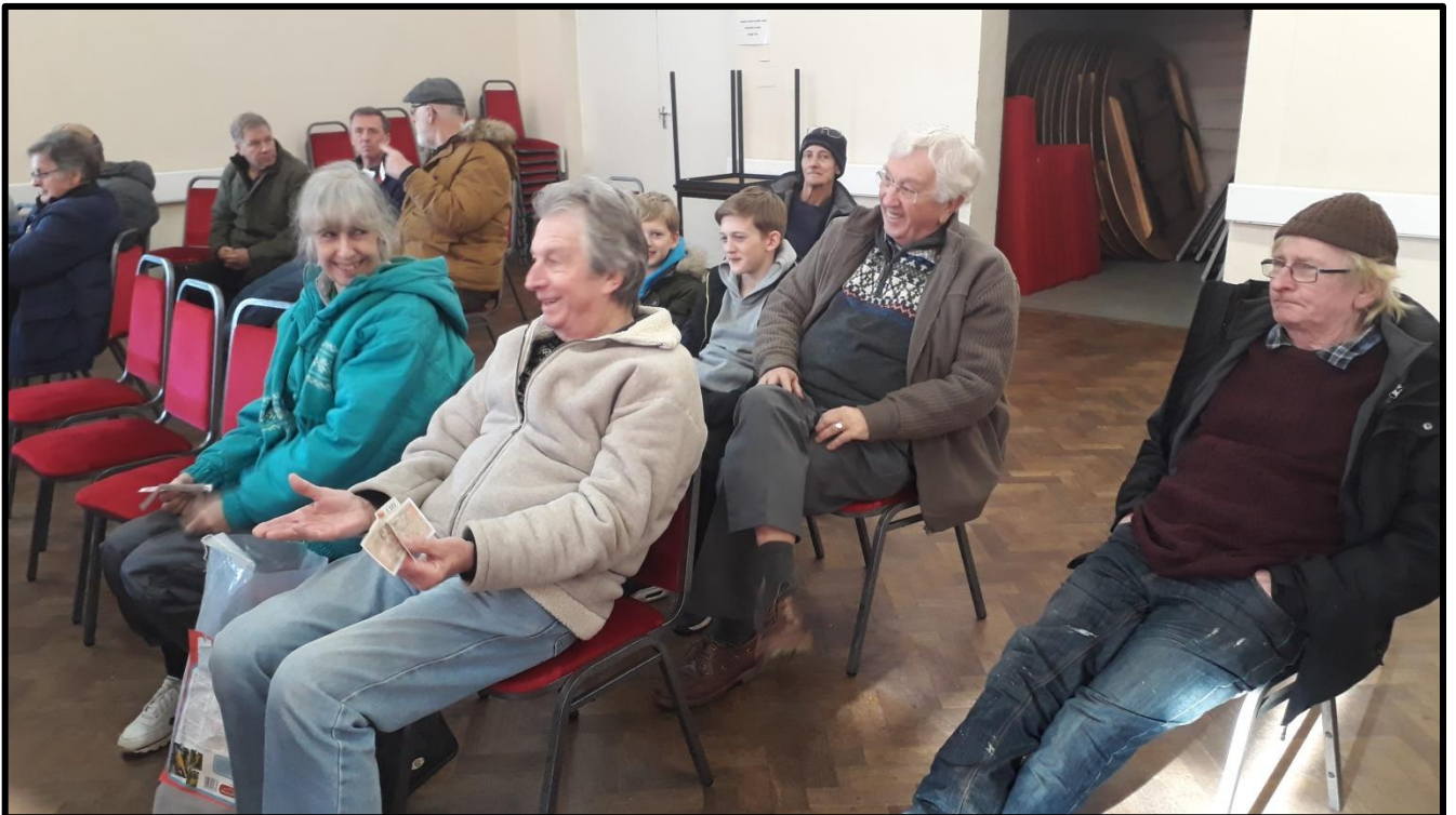
Some pictures of our show in December 2019