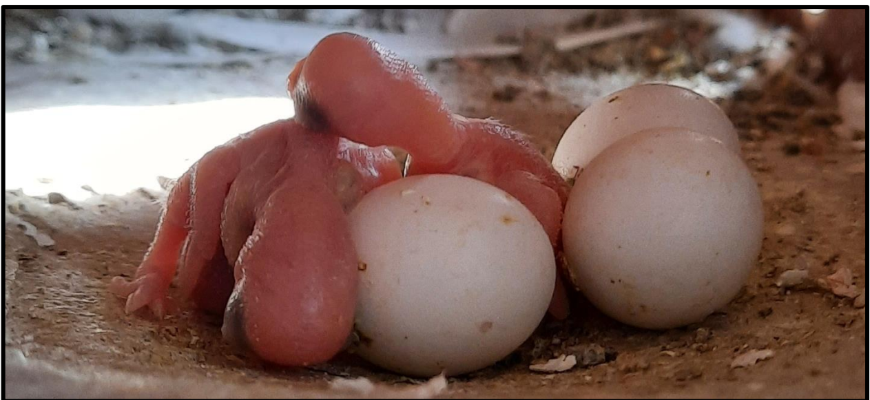
Two baby budgies 2 days old