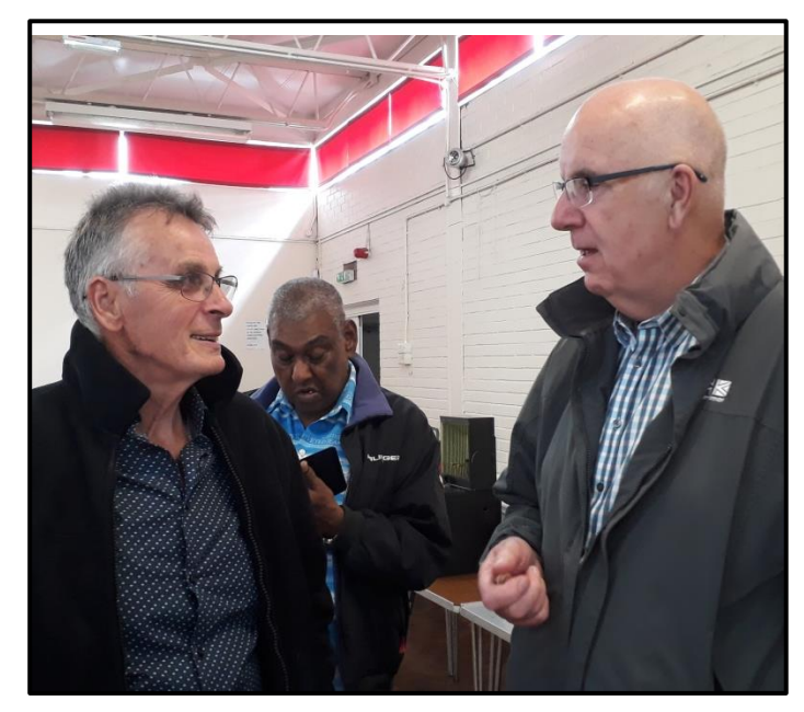
Dagenham CBS welcomes Batman to our meeting. Left Picture