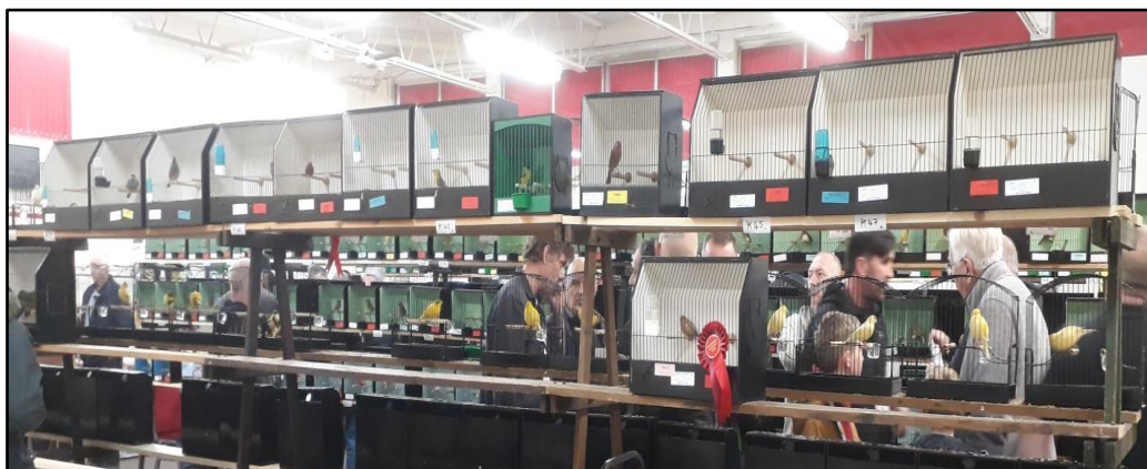
Some of Barry's Photos from the December Open show