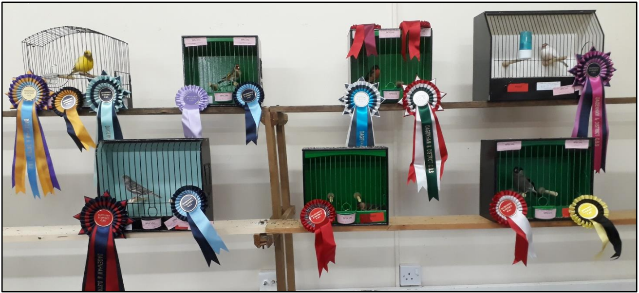
Below some of the winning birds on the Show Winners Stand