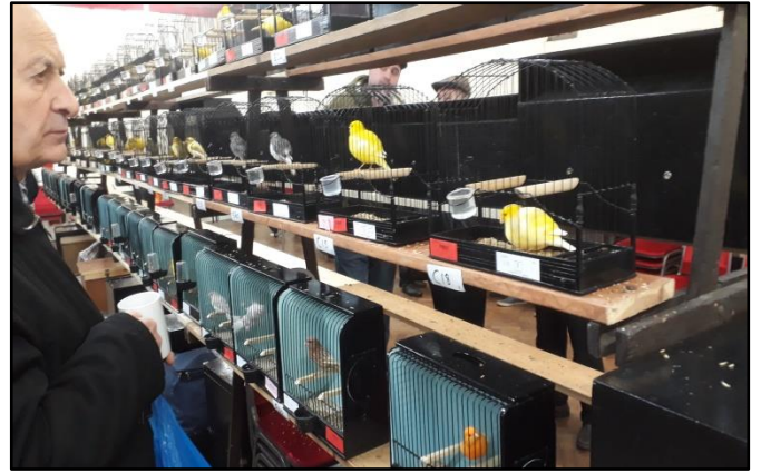
Ted having a look at the many birds at the show