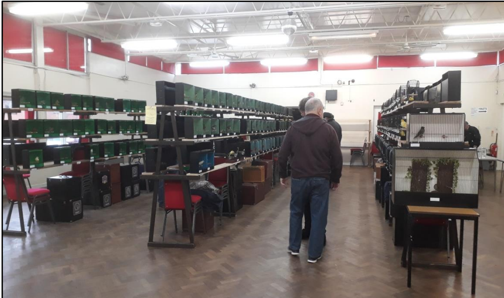
The birds are arriving and the stands are filling up