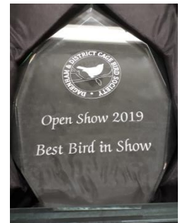
Trophies given for Best in Section & Show donated by Vista Workspace Solutions