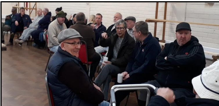
Some of the Members who helped with the Staging