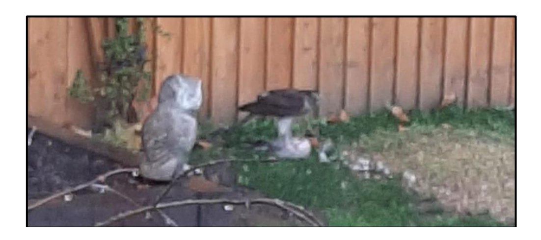
Photo of a Sparrowhawk attacking a Collared Dove