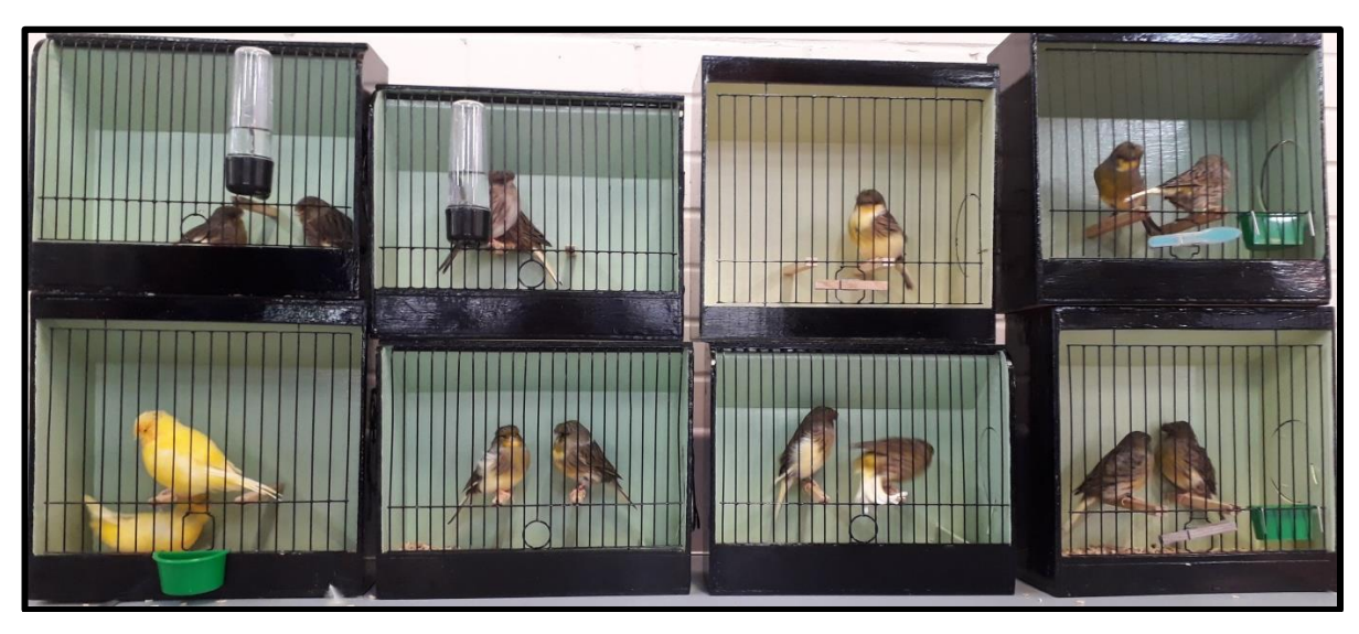
Some of the Members' birds that were for sale