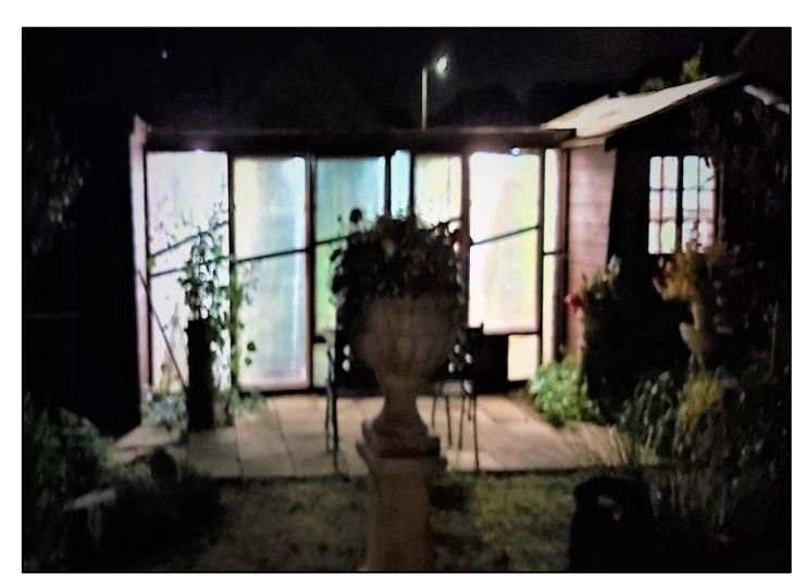
My aviary at night